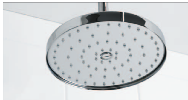
Easy clean Deluge shower head