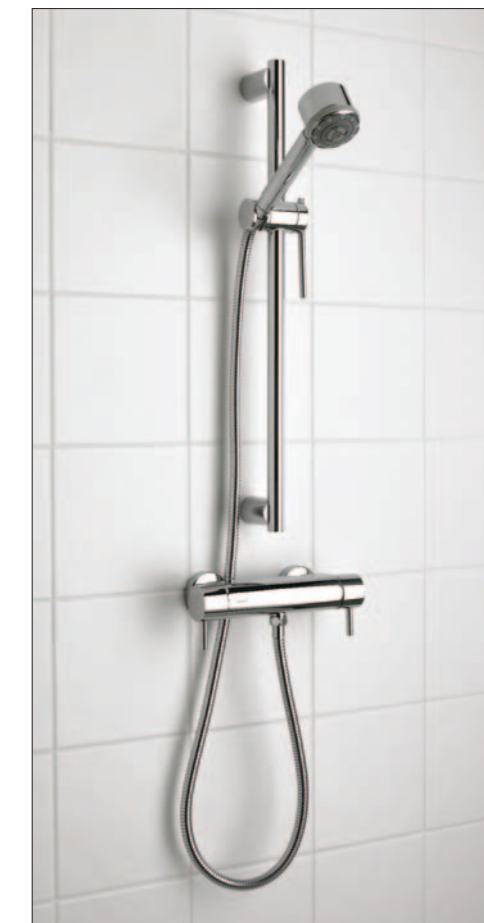
MAIN PICTURE: Model EX1 Concealed shower mixer. ABOVE LEFT: Model EX2 Concealed shower mixer. ABOVE: Model EX5 Concealed shower mixer. FAR LEFT THIS PAGE: Model EX910/MF Thermostatic exposed shower mixer with diverter, slide bar, three function hand shower and flexible hose on wall mounted assembly. LEFT: Model EX010/MF Thermostatic exposed shower mixer with separate slide bar, three function hand shower and flexible hose.