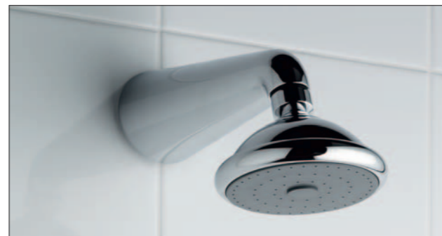
Model EX007 fixed