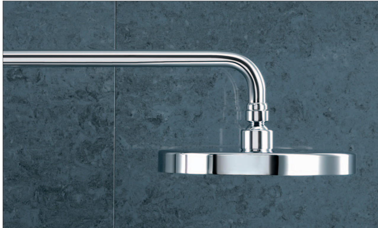
Model EX008 Deluge